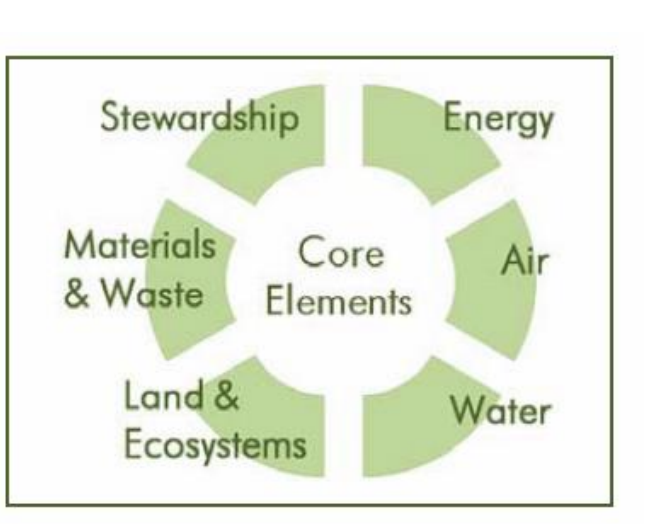
Figure 2. Best management practices of green remediation balance core elements of a cleanup project.